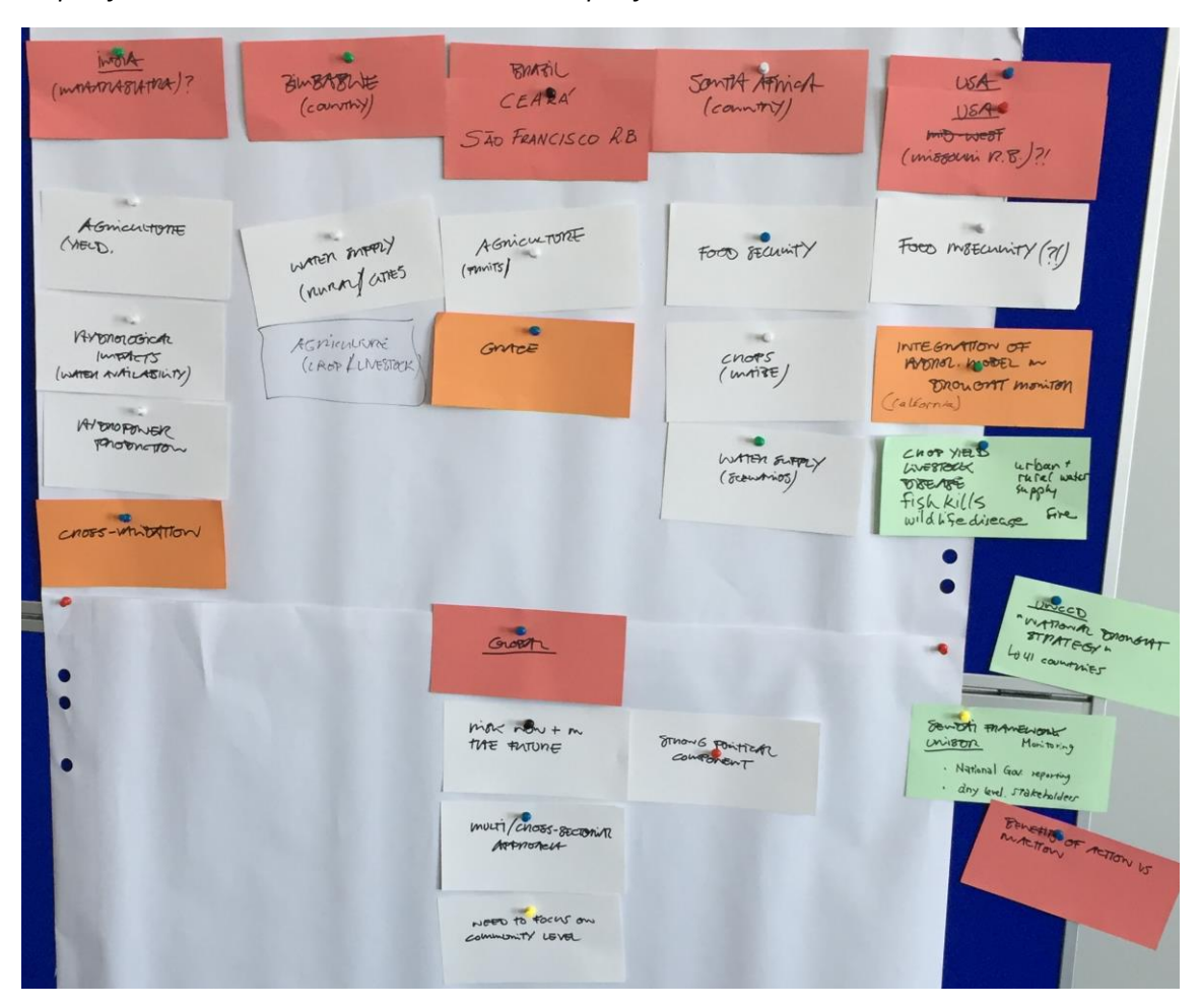
Fig. 1: Study areas and drought impacts in these regions.

The session was moderated by Dr. Michael Hagenlocher (UNU-EHS). The goal of this session was to determine the primary drought impacts and the extent of study areas to focus on in each region. This was achieved through dialogue with the regional experts and included also questions regarding the state of risk assessments, data availability, but also around current gaps and needs in the regional study areas that could be catered by the GlobeDrought project. The main ideas were collected on a pin board (Fig. 1). These results helped frame the next discussion on technical specifications.